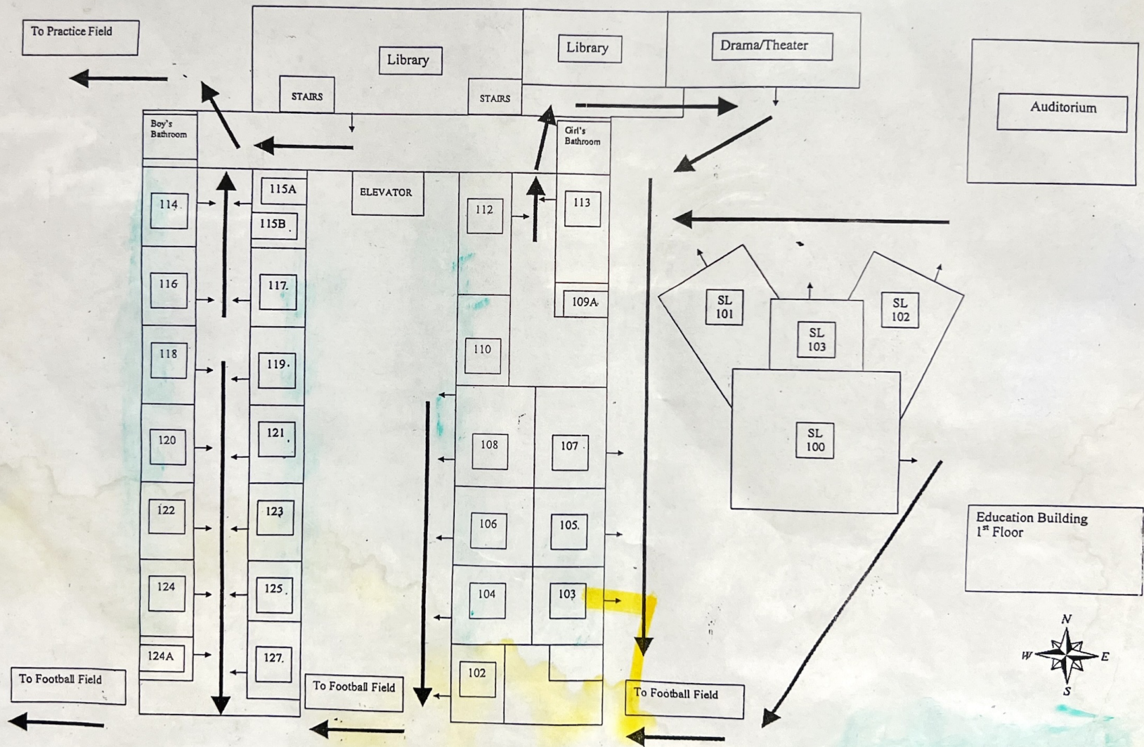
U-Building Room Map